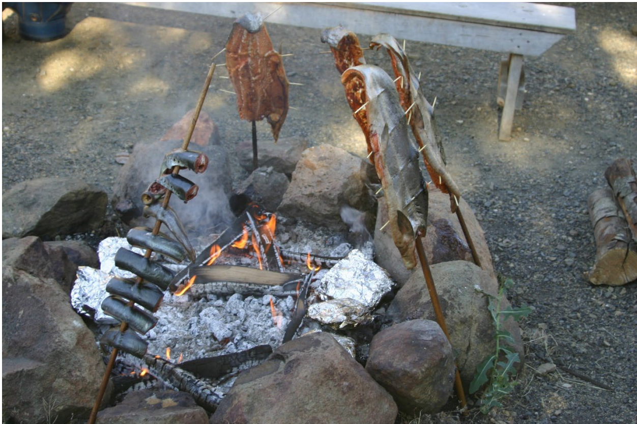
Salmon and Lamprey Cooking