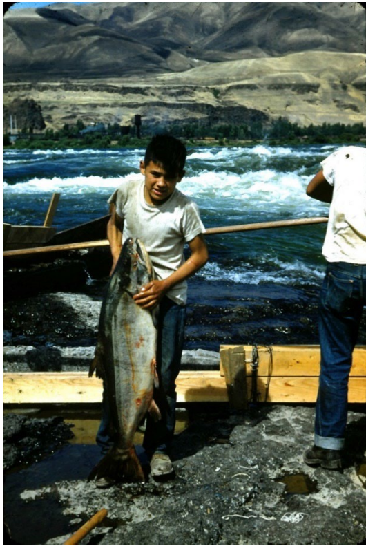
Fall chinook at Celilo Falls