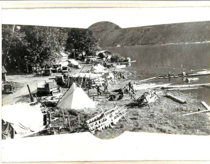
Underwood (at mouth of White Salmon River) with drying salmon