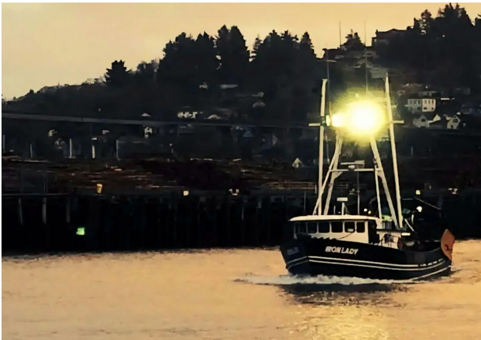
The F/V Iron Lady.

A celebration of life will be held at 1 p.m. on Sunday, April 12, the Clatsop County Fairgrounds (92937 Walluski Loop) in Astoria.