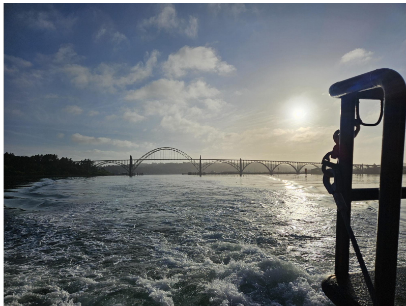
On the chartered F/V Excalibur departing Newport early June 3, 2025 for the start of leg 2 of the groundfish bottom trawl survey, following a weather delay.