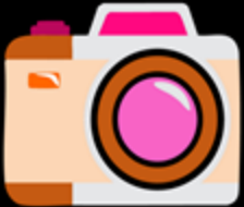
Photo and video assets