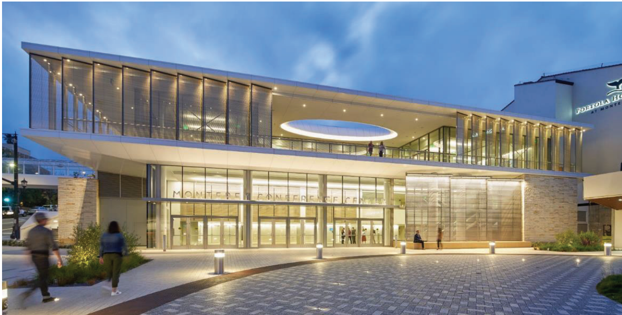
Monterey Conference Center and Portola Hotel & Spa at Monterey Bay

The recently constructed conference venue is in the center of downtown Monterey and is connected to the Portola Hotel & Spa at Monterey Bay.