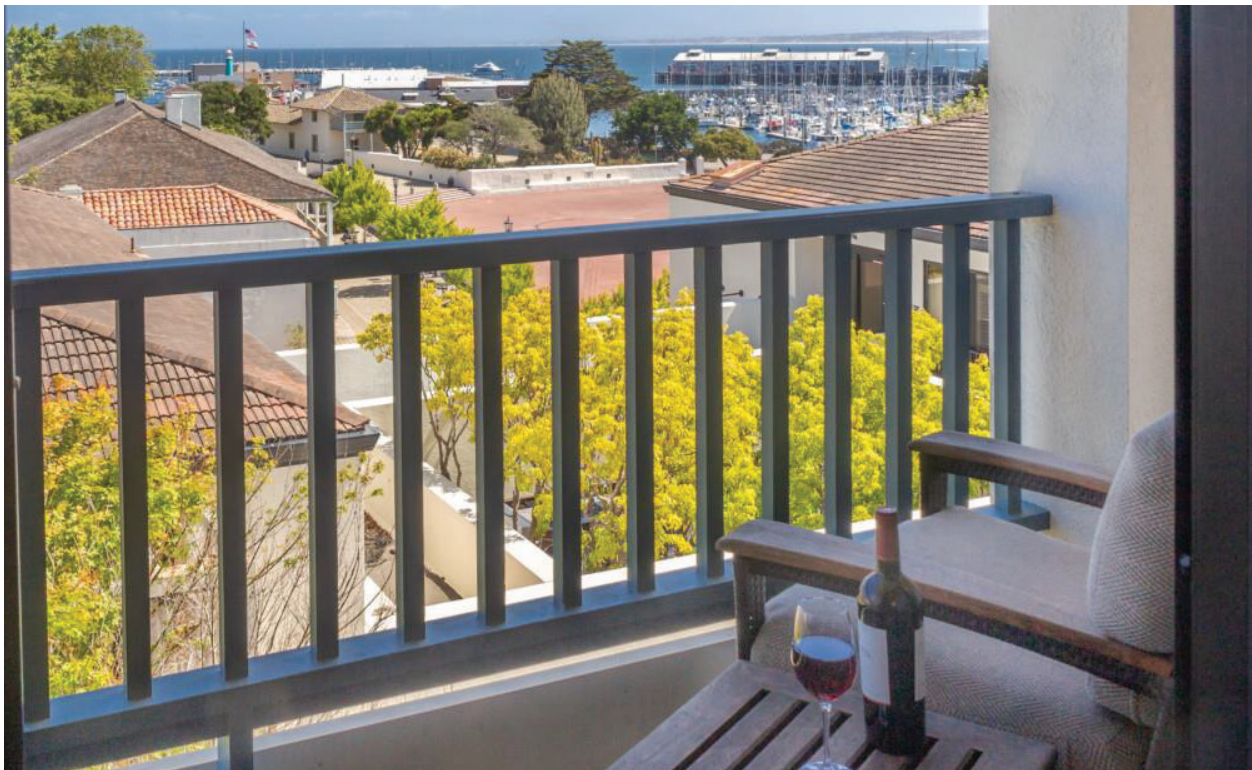
Portola Hotel overlooking the waterfront, Fisherman's Wharf and the recreational trail

Participants are encouraged to make hotel reservations as soon as possible to access the special group rate. The Portola Hotel will accept reservations at the special group rate on a first-come, first served basis, and all reservations must be made by January 6, 2025.