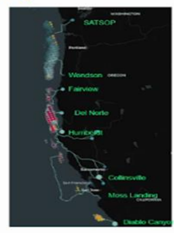
D - 2050 Interregional