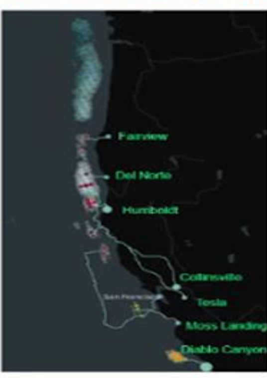
B - 2035 Radial