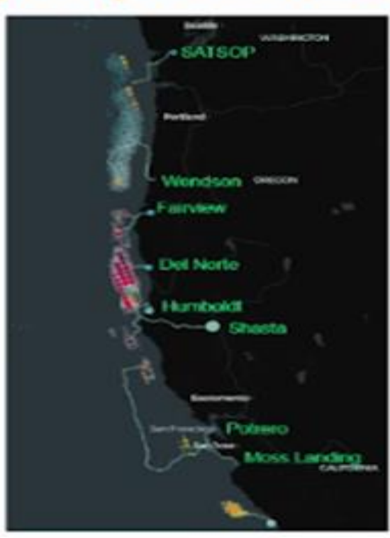
C - 2050 Intraregional