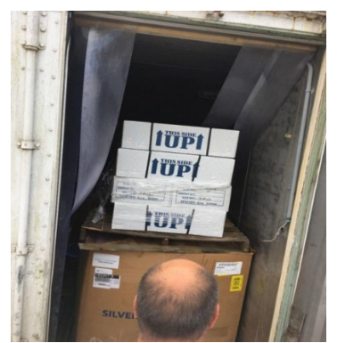
Boxes of illegally taken salmon

https://www.justice.gov/usao-wdwa/pr/lummi-nation-member-sentenced-violating-lacey-act-purchasing-more-7000-pounds-illegally