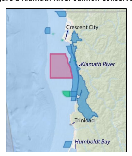
Figure 1 Klamath River Salmon Conservation Zone

Rule. The Klamath River Salmon Conservation Zone will be closed to EFP trips for the duration of the EFP.