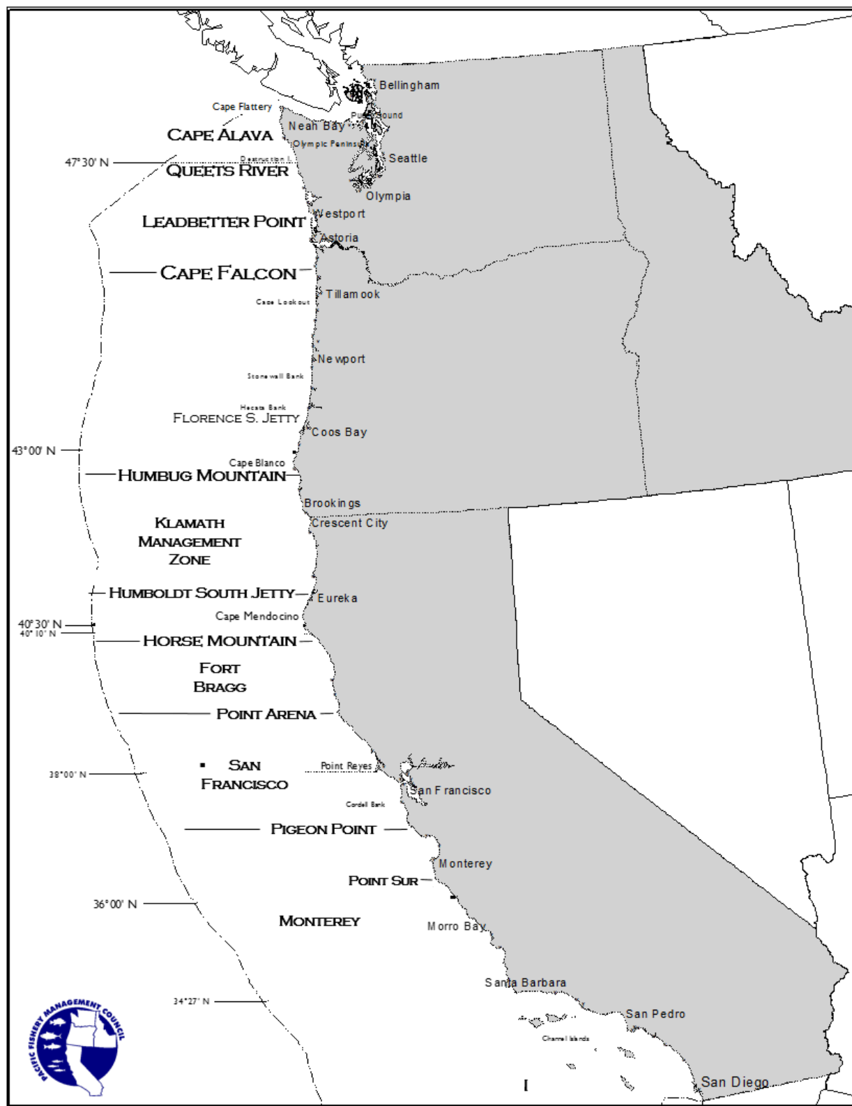
FIGURE 3. Map of Pacific West Coast with major salmon ports and management boundaries. This map is for reference only and is not intended for use in navigation or fishery regulation.