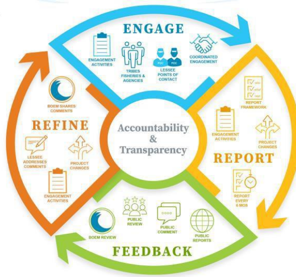
Figure 3. BOEM Stakeholder Communication Approach

The GSW FCP has been developed based on Lease stipulations and BOEM guidelines. The objective is to define outreach and engagement strategies for fisheries interests that may be affected during the planning, construction, operation, and eventual decommissioning of the Project. These strategies will be enhanced with inputs received from the fishing community and updated as the Project progresses.