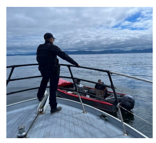
Figure 10. OSP Fish and Wildlife Troopers on Patrol