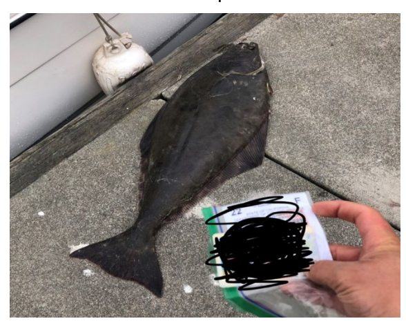
Figure 13. CDFW Wildlife Officer issued a citation for retention of Pacific halibut out of season

Seven commercial contacts and 417 recreational contacts were made enforcing halibut regulations. Three citations were issued this year. One citation was issued for no fishing license. The second citation was issued for fishing for Pacific halibut with too many rods. A third citation was issued for fishing for Pacific halibut after the quota was reached and the season was closed.