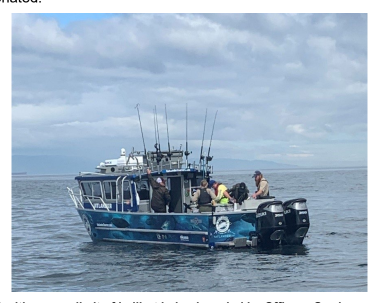
Figure 3. Charter boat with an overlimit of halibut being boarded by Officers Garrison and Ariss

3 and 4. Numerous tickets were written for fail to record, fishing in a closed area, use of barbed hooks, and expired registration. There were two very notable cases, however. The first involved the overlimit on halibut of a charter boat well known for numerous violations including stowing additional fish in a hidden compartment. Though the additional halibut Officers Garrison and Ariss located were not in a hidden compartment, it was enough to put them over their limit. The second case made by Detachment 3 involved a bottomfishing vessel fishing in a rockfish conservation area. As the officers approached, Sgt. Dielman observed a yelloweye rockfish floating about two feet from the suspect vessel. Sgt. Dielman grabbed it out of the water and realized the fillets had been removed from it. Though there were no other boats within 5 miles, the suspect stated "That is not mine." Once on board, the group was found to also be overlimit on halibut (they had started to fillet the excess fish), had not recorded any halibut, and did not possess a descending device. In total, all the adults were cited for fishing closed area and fail to record. The Captain received additional citations for the yelloweye rockfish, overlimit halibut, fail to submit catch for inspection, wastage, and descending device. A total of 11 lingcod, 8 halibut, and one canary rockfish were seized and later donated.