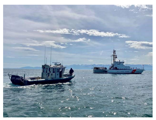
Figure 2. WDFW Patrol Boat #2 and USCG Cutter Wahoo in the Strait of Juan de Fuca

and Davidson patrolling Marine Area 5 for closed-season halibut fishermen boarded one recreational vessel fishing for salmon. The anglers possessed several un-recorded salmon, and salmon in an unlawful condition (no proof of hatchery origin or length). The salmon anglers will be cited through the mail for the violations. The boarding crew of the Cutter Wahoo (based in Port Angeles) apprehended two subjects aboard a vessel near Hien Bank who possessed illegal narcotics including two dozen unprescribed opioid pills, and several grams of cocaine. The following day the same boarding team caught an illegal charter vessel targeting halibut. The operator of the vessel did not have a valid USCG license and was not enrolled in a required drug screening program. Special thanks to the USCG Air Station in Port Angeles for getting WDFW Pilot Kimbrel up for a boat effort count of Marine Area 6 on the Thursday opener (the WDFW plane was grounded as logistical issues hampered delivery of repair parts). Sgt. Alexander, Officer Cilk and Baldwin performed a boat patrol in MA 2 and boarded multiple boats; two citations were issued for failing to record halibut.