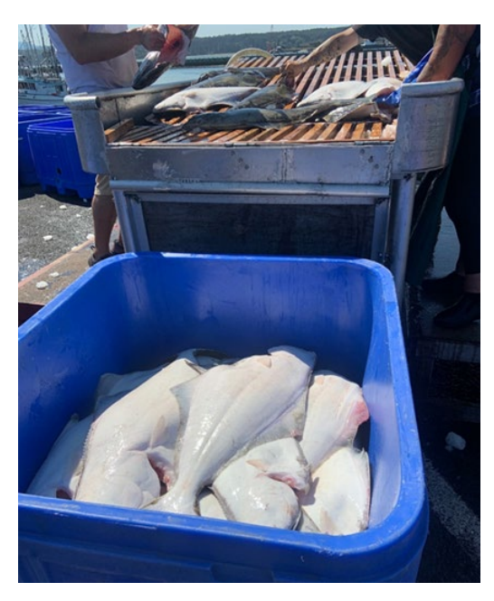
Figure 15. NOAA OLE Enforcement Officer inspects an offload of halibut in Newport, OR

Enforcement operations for the third and final 2022 IPHC Area 2A opener were conducted from July 26th to July 28th, with follow-up operations on July 29th. An EO was assigned patrol operations in the areas of Coos Bay Newport and Astoria, OR, and Ilwaco, WA. An SA was assigned to provide investigative support for potential instances of complex or criminal investigations arising from any of the operations. Air operations were again considerably hampered by poor weather conditions with most flight operations being canceled due to heavy offshore fog. However, 2 patrols were still conducted for a total of 7 flight hours. The flights focused on the detection of sea bird avoidance gear violations, as well as fishing activity after the designated closing time. No at-sea patrols were conducted during this opener. Six shoreside patrols totaling 52 hours were conducted, and resulted in 14 vessels contacted. These contacts identified 1 logbook violation, 1 VMS violation, 3 fishing without sea bird avoidance gear, and 1 violation referred to JEA partners.