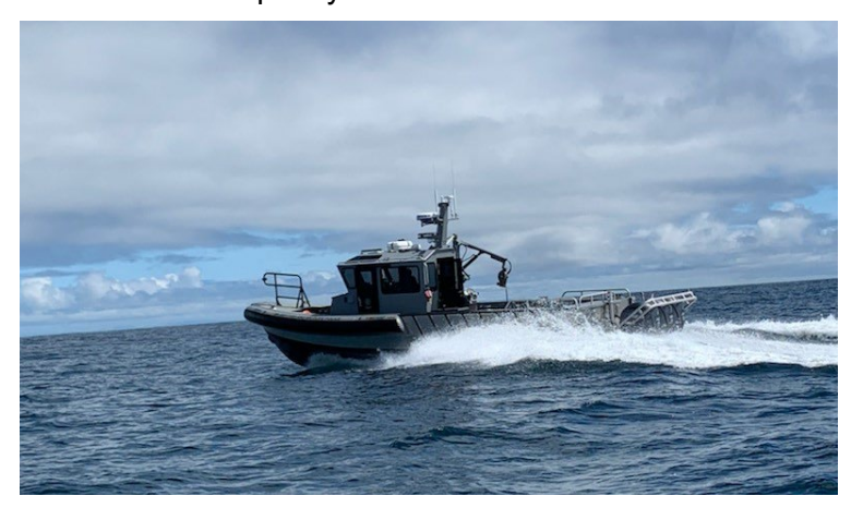
Figure 1. Washington Department of Fish and Wildlife's new 41-foot coastal patrol boat

WDFW acquired a new 41-foot coastal patrol boat that replaces the P/V Corliss . This vessel was funded through the Joint Enforcement Agreement and State Funds. Officers put many hours on it enforcing the halibut fisheries this past year.