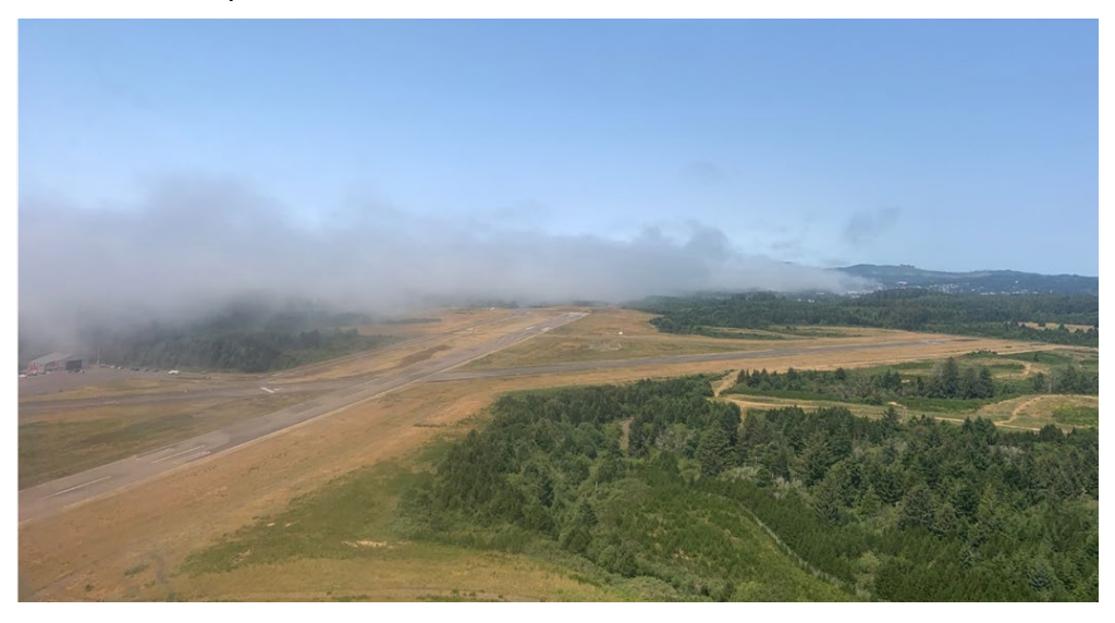
Figure 16. Air operations significantly hampered by poor weather conditions during most of the openers

Enforcement operations for the third and final 2022 IPHC Area 2A opener were conducted from July 26th to July 28th, with follow-up operations on July 29th. An EO was assigned patrol operations in the areas of Coos Bay Newport and Astoria, OR, and Ilwaco, WA. An SA was assigned to provide investigative support for potential instances of complex or criminal investigations arising from any of the operations. Air operations were again considerably hampered by poor weather conditions with most flight operations being canceled due to heavy offshore fog. However, 2 patrols were still conducted for a total of 7 flight hours. The flights focused on the detection of sea bird avoidance gear violations, as well as fishing activity after the designated closing time. No at-sea patrols were conducted during this opener. Six shoreside patrols totaling 52 hours were conducted, and resulted in 14 vessels contacted. These contacts identified 1 logbook violation, 1 VMS violation, 3 fishing without sea bird avoidance gear, and 1 violation referred to JEA partners.