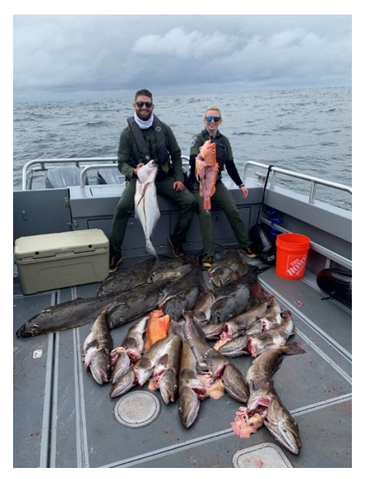
Figure 4. Fish seized from one vessel in a rockfish conservation area. Note the filleted yelloweye and partially-filleted overlimit of halibut.