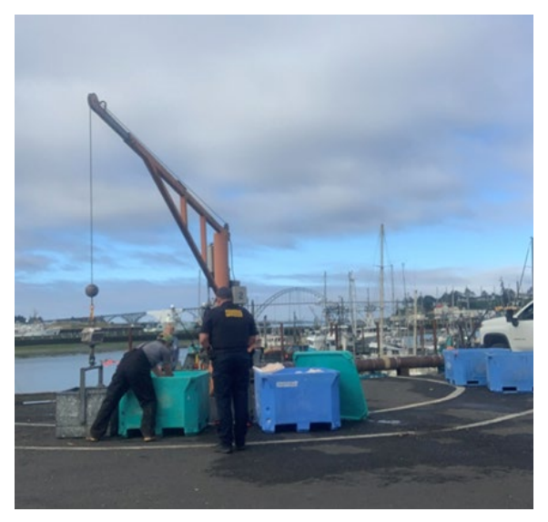
Figure 14. NOAA OLE enforcement officer inspects an offload in Newport, Oregon

investigations occurring in Area 2A during the operations. Due to staffing shortages during the first opener, patrols were limited. In addition, EO participation aboard the USCG Cutter Steadfast were canceled due to Covid-19 concerns. Air operations consisted of 5 patrols totaling 21 flight hours with no observed violations. No at-sea patrols were conducted during the first opener. Eight shoreside patrols were conducted totaling 77 hours, and resulting in 17 dockside boardings, and 2 state violations observed that were referred to JEA partners for further handling.