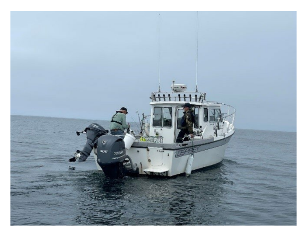
Figure 12. OSP Fish and Wildlife Trooper Boarding Vessel

A Fish and Wildlife Trooper conducted an ocean patrol from Nehalem to Cannon Beach. Numerous recreational salmon anglers, halibut anglers, rockfish anglers, and commercial salmon fisherman were contacted. Five citations were issued for Angling Prohibited Method - Barbed Hooks for Salmon, one citation was issued for Taking Halibut - No Harvest Card, one citation was issued for Taking Salmon - No Harvest Card, and one citation was issued for Fail to Immediately Validate Harvest Card - Halibut.