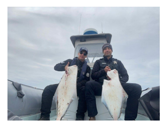
Figure 11. OSP Fish and Wildlife Troopers with Seized Halibut

Fish and Wildlife Troopers contacted a boat returning from halibut fishing at the South Beach Marina. During the contact, an angler disclosed that in addition to the halibut they had checked, he had another filleted halibut on board from the day before. The angler was cited for Exceeding Possession Limit of Pacific Halibut, and warned for Possession of Mutilated Marine Fish. The filleted halibut was seized and donated to the Newport Senior Center.