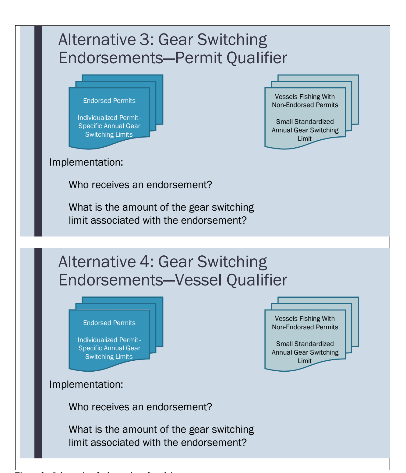
Figure 3. Schematic of Alternatives 3 and 4.