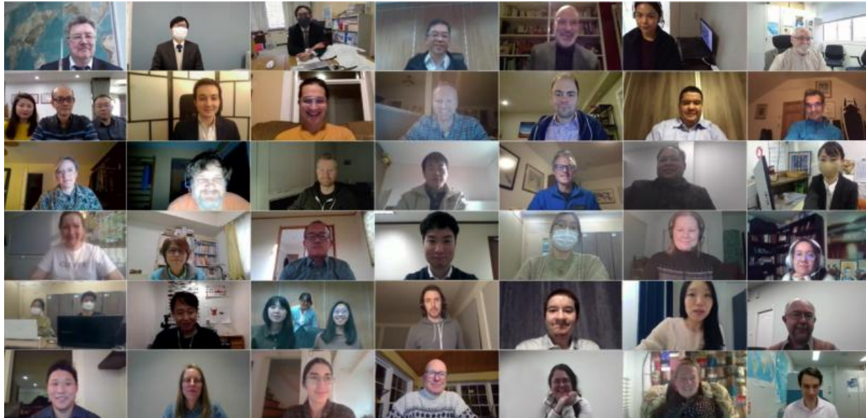
Figure 1. Partial screen shot of Feb. 2021 virtual North Pacific Fisheries Commission annual meeting.

An active recruitment is in progress for the Commission's Executive Secretary position – the incumbent announce his planned departure earlier this year. The next annual dates for the Commission's annual meeting and associated 'run up' meetings have been scheduled for the March 23-30, with in-person or virtual not decided and if former, no location set. they are likely to occur in early 2022 (before mid-year).