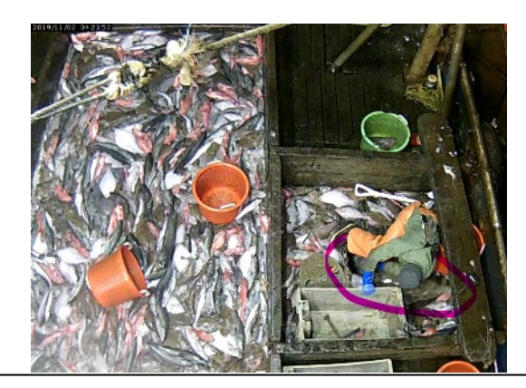
Deckhand concealing Pacific Halibut while sorting groundfish.

- A Special Agent investigated a complaint from the Quinault Tribe of a Makah tribal vessel violating its usual and accustomed treaty area and illegally harvesting sablefish. NOAA GCES issued a NOVA resulting in a settlement agreement of $20,000.