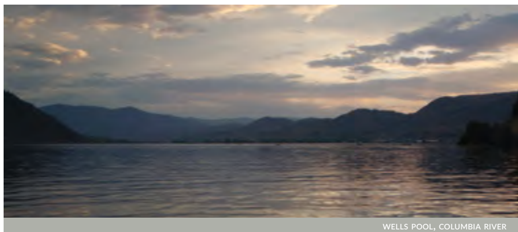
WELLS POOL, COLUMBIA RIVER

Since time immemorial, indigenous people in the Columbia Basin lived a way of life that was sustained by a healthy ecosystem. Fish were a mainstay of their diet—sustaining them both physically and spiritually. Salmon still connect the native people of the Pacific Northwest to the Earth and to each other. The Columbia Basin tribes with management authorities and responsibilities affected by the Columbia River Treaty have joined with their First Nation and Indian Band relations in Canada to develop this paper (see map showing blockages to historic fish passage, and Tribes and First Nations at http://www.critfc.org/tribal-treaty-fishing-rights/policy-support/columbia-river-treaty/restore-fish-passage/ ).