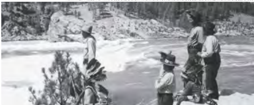
CHIEF JIM JAMES OF THE SAN POIL TRIBE AND OTHERS VIEW FISHING SITES AT KETTLE FALLS