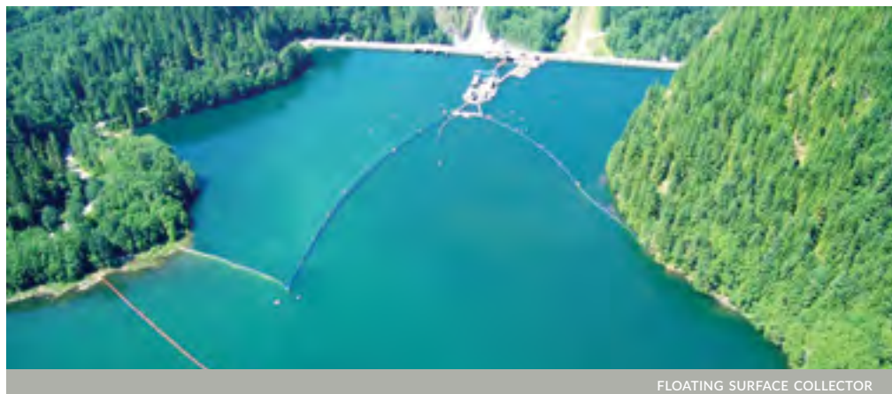
FLOATING SURFACE COLLECTOR

While a thorough vetting of passage strategies and technologies would be an important subject for Phase I and II planning, the recent Future of Our Salmon Conference provided some information and options for early consideration. In summary, the adult and juvenile passage facilities at the run-of-river Columbia River dams—ladders for adults and turbine screens and spill for juveniles—may not be feasible for the higher head dams in the upper Columbia. The floating surface collectors (FSC) being assessed by Puget Sound Energy at its Baker Lake projects, Pacific Power & Light at its Lewis River projects, Portland General Electric at its Clackamas projects, and the Corps of Engineers at its Willamette Basin projects are showing success in collecting large numbers of juvenile fish in highly fluctuating reservoirs behind high head dams. Trap-and-haul facilities for adult passage continue to be a reliable technology; in the upper Columbia River such facilities could at least serve in an interim capacity while more permanent passage solutions are developed.