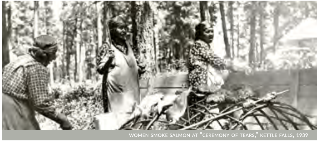
WOMEN SMOKE SALMON AT "CEREMONY OF TEARS," KETTLE FALLS, 1939

NORTHWEST MUSEUM OF ARTS & CULTURE/EASTERN WASHINGTON STATE HISTORICAL SOCIETY, SPOKANE, WASHINGTON, L95-80.1