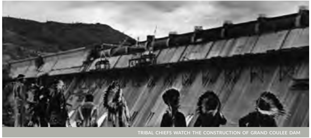
TRIBAL CHIEFS WATCH THE CONSTRUCTION OF GRAND COULEE DAM

The adult and juvenile fish passage technologies being considered here should function within the current operational limits and purposes of the U.S. and Canadian projects. Existing project benefits are expected to remain largely intact.