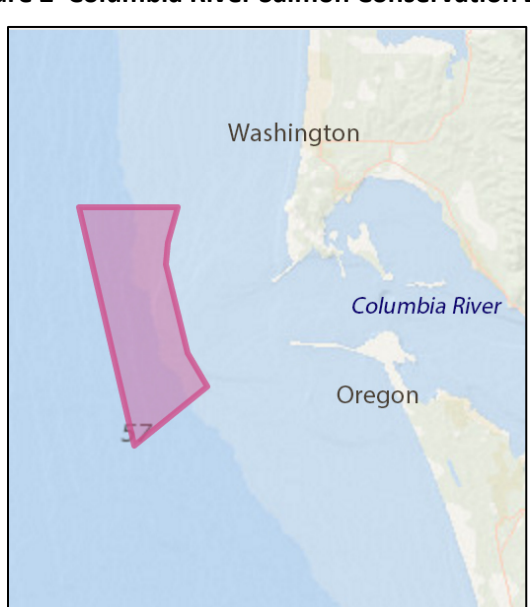
Figure 2 Columbia River Salmon Conservation Zone

Rule. The Columbia River Salmon Conservation Zone will be closed to EFP trips for the duration of the EFP.