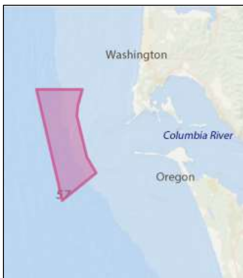
Figure 2 Columbia River Salmon Conservation Zone

Rule. The Columbia River Salmon Conservation Zone will be closed to EFP trips for the duration of the EFP.