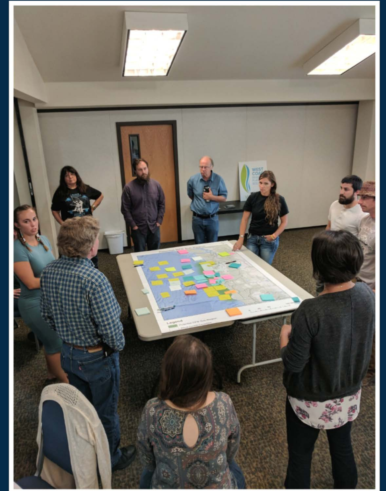
Oregon – Northern CA Tribal Meeting – Sept 2017