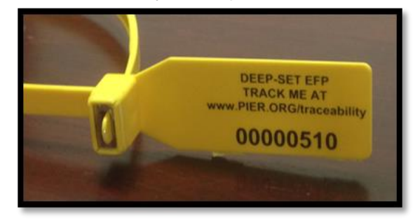
Figure 3. Collar tag used to trace DSBG-caught fish through the market chain.

verified through observer and logbook records. In year 2, all catch was also tracked using collar identification tags (Figure 3). Collar tags have enhanced the tracking of EFP fish through the market and have positively contributed to market price. Preliminary estimates suggest an average market price of approximately $7.50/lb.