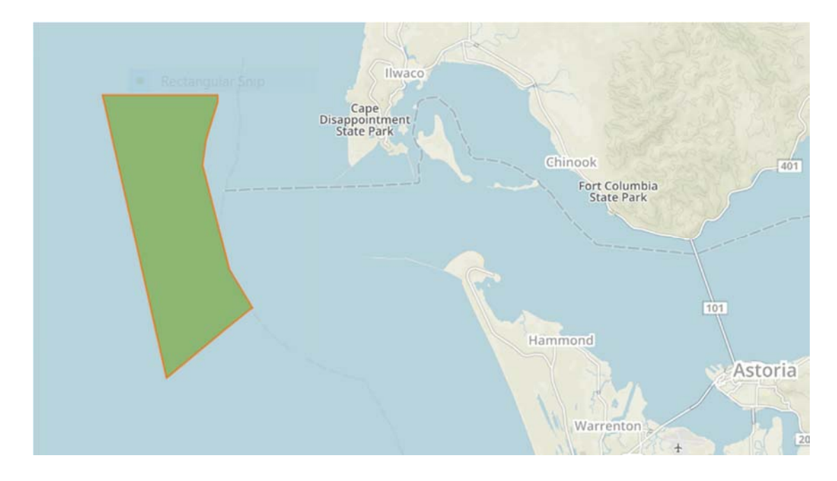
Figure 2: Columbia River Salmon Conservation Zone that is closed to the EFP.

Columbia River Salmon Conservation Zone - The targeting of Pacific whiting with midwater trawl is prohibited in the ocean area surrounding the Columbia River mouth bounded by a line extending for 6 nm due west from North Head along 46°18′ N. lat. to 124°13.30′ W. long., then southerly along a line of 167 True to 46°11.10′ N. lat. and 124°11′ W. long. (Columbia River Buoy), then northeast along Red Buoy Line to the tip of the south jetty. The Columbia River conservation zone was established in 1993 because of the concentrations of Chinook salmon in the area.