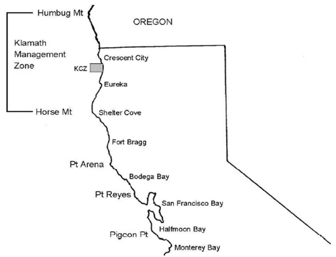
Figure 1: Map of the Klamath Conservation Zone (KCZ) that would closed to the expanded year-round, coastwide, midwater EFP

Klamath River Salmon Conservation Zone - The targeting of Pacific whiting with midwater trawl is prohibited in the ocean area surrounding the Klamath River mouth bounded on the north by 41°38.80′ N. lat. (approximately 6 nautical miles (nm) north of the Klamath River mouth), on the west by 124°23′ W. long. (approximately 12 nm from shore), and on the south by 41°26.80′ N. lat. (approximately 6 nm south of the Klamath River mouth). The Klamath River conservation zone was established in 1993 because of the concentrations of Chinook salmon in the area.