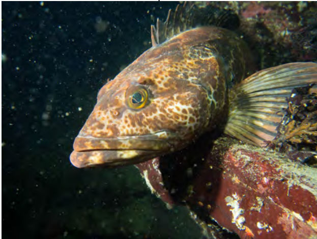
Lingcod. Photo: Eva Funderburgh, Flickr Creative Commons.

Due to concerns over Klamath River fall Chinook, NMFS split the selective flatfish trawl EFP into two geographic areas, north and south of 42° N. latitude. The northern EFP was issued in February 2017, and salmon bycatch limits for the EFP were discussed in March. NMFS declined to implement the southern area EFP due to ongoing concerns about Klamath Chinook salmon. Through June 5, 2017, eight vessels have taken 35 trips and caught four Chinook and 1.65 million pounds of groundfish.