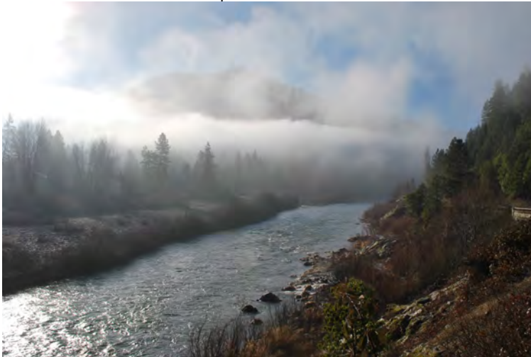
The Klamath River near Happy Camp, CA.

The second project would provide a correction factor to the acoustic trawl survey conducted by NOAA. This project is not currently possible because it depends on estimating the proportion of fish that are visible from the air, and such an estimate is currently unavailable.