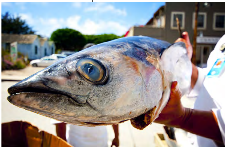
Monterey albacore.

The Council was disappointed with the NMFS decision to halt implementation of the hard cap rule. While the current Endangered Species Act consultation standards do a good job of protecting and rebuilding listed species, they focus on population-level effects, and don't necessarily have immediate consequences to the fisheries when thresholds are reached. The