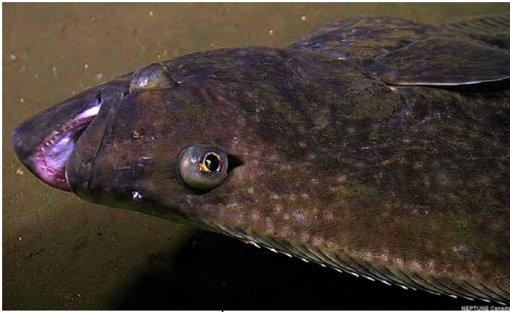
How can this be comfortable?