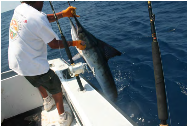
A striped—or possibly blue—marlin caught and released in Mexico.

The development of a rebuilding plan for Pacific bluefin tuna is a high-priority international issue for the Council. The stock is currently estimated at 2.6 percent of unfished biomass. In June, the Council supported the draft U.S. proposal to the Inter-American Tropical Tuna Commission (IATTC) for a second rebuilding target for Pacific bluefin tuna (20 percent of the unfished spawning stock biomass, assuming current recruitment) to be achieved by 2030 with