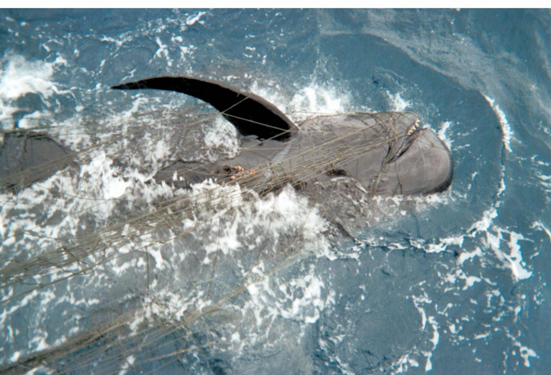
Short-finned pilot whale killed in CA DGN fishery