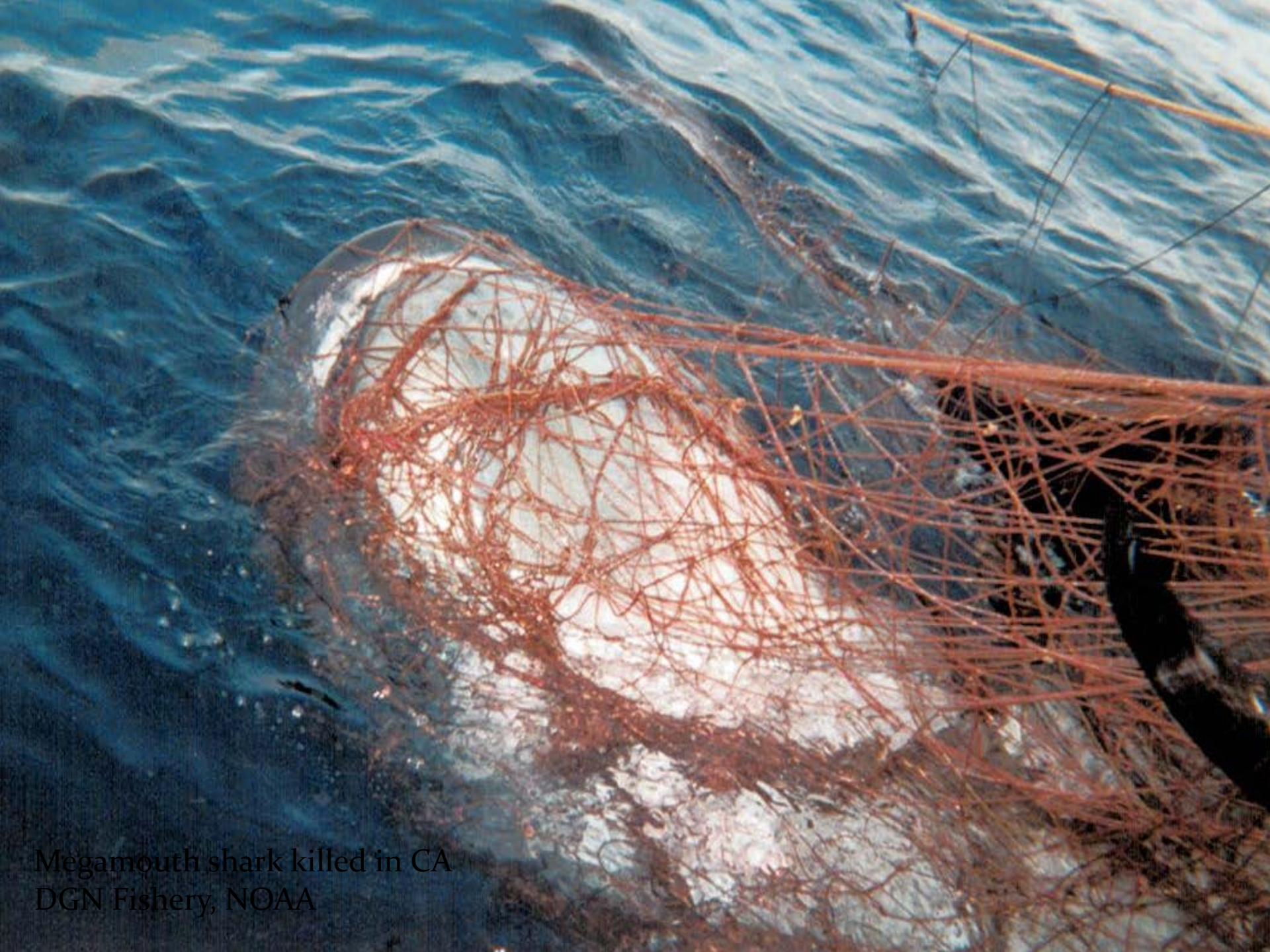
Megamouth shark killed in CA DGN Fishery, NOAA