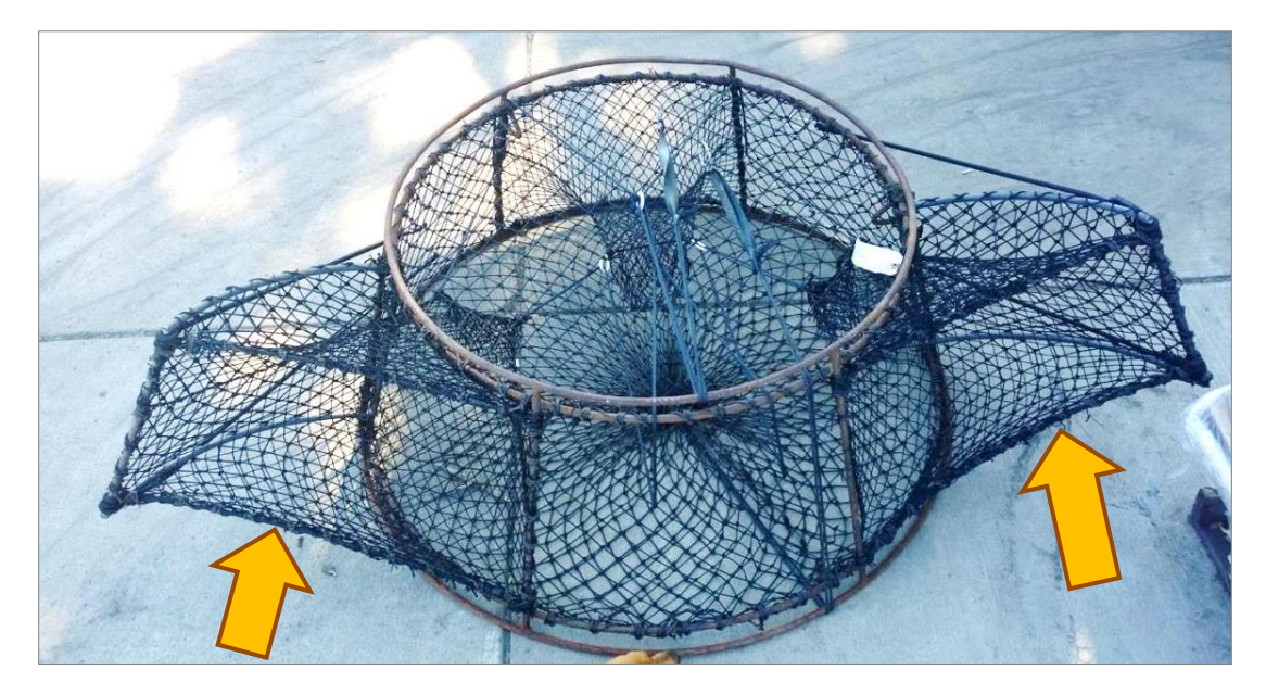
Figure 3. Trigger pot gear with top-mounted camera on deck of F/V Morning Star. Preliminary gear testing, June 2014.

Figure 2. Collapsible-wing pot for EFP testing. Arrows indicate entry points for fish. Escapement ring not shown.