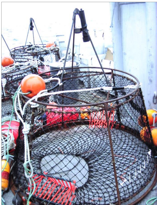
Figure 3. Trigger pot gear with top-mounted camera on deck of F/V Morning Star. Preliminary gear testing, June 2014.