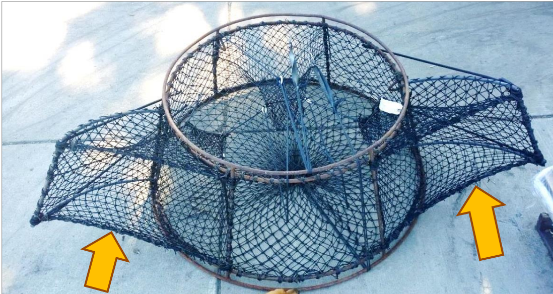
Figure 3. Trigger pot gear with top-mounted camera on deck of F/V Morning Star. Preliminary gear testing, June 2014.