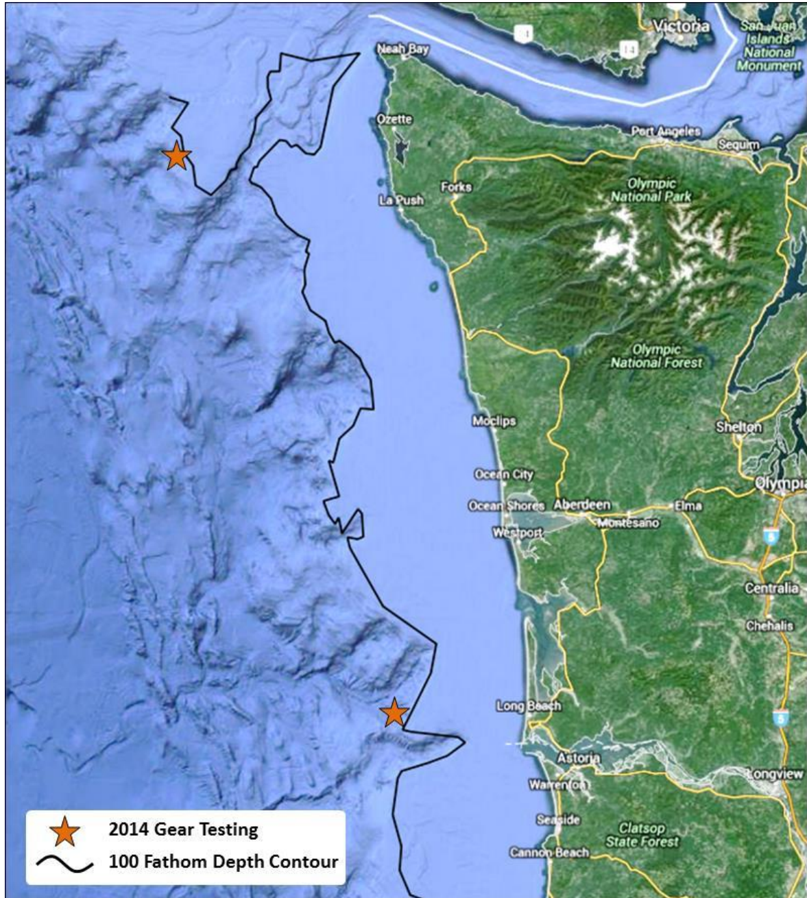
Figure 1. Study Area for 2014 gear testing