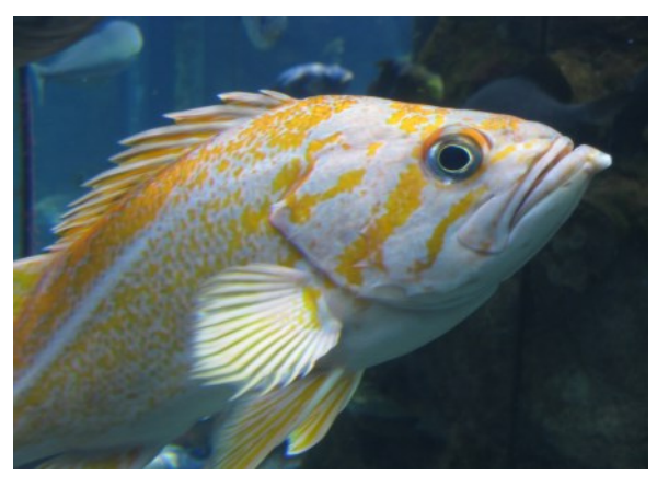
Canary rockfish.

The Council received an update on the process of considering changes to groundfish essential fish habitat and Rockfish Conservation Areas, including an update from a col-