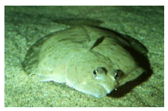
Petrale sole

The petrale sole stock, an important target for the limited entry bottom trawl fishery, was declared overfished in 2010 after an assessment showed that the stock had fallen below the overfished threshold. Beginning in 2011, a rebuilding plan was implemented to rebuild the stock by 2016. The petrale sole harvest limit was cut by half, and fisheries in which petrale sole could be caught incidentally were also reduced. A stock assessment conducted this year shows that the rebuilding plan was successful and the stock has increased over the target level.