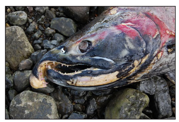
The remains of a spawned-out salmon near the Columbia River this November.

This year the Council adopted a new Oregon coastal natural coho abundance predictor, and updated indicator stock codedwire-tag groups for Columbia River summer Chinook used in the Chinook Fishery Regulation Assessment Model.