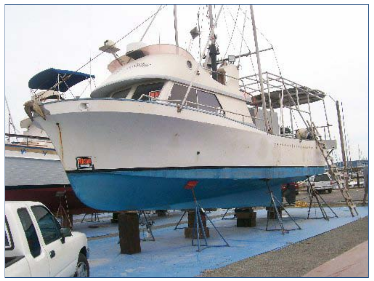
Boat for sale