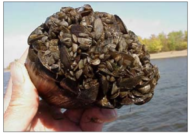
Zebra mussels clinging to a native mussel.

The NOAA Coral Reef Conservation Program (CRCP) has been charged with coordinating the implementation of the Deep Sea Research and Technology Program authorized by the Magnuson-Stevens Act. The 2006 re-authorization required that a Deep Sea Coral Research and Technology Program be established, and autho-