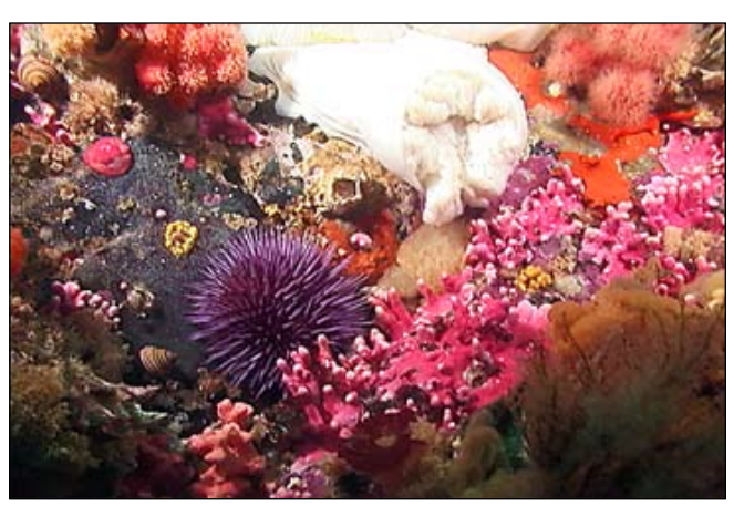
Coldwater corals.

rized, among other things, the designation of zones to protect deep-sea corals. FY2009 is the first year that the program has been funded, and the CRCP has proposed a funding model characterized by significant investment in research activities on a region-by-region basis. The CRCP has dedicated most FY2009 funds to the South Atlantic region, and proposes to focus on the Pacific region in FY2010. The CRCP is looking at criteria for prioritizing other regions beyond 2010. In the HC's report, the committee noted that "By almost any standard, the U.S. west coast ranks high for immediate attention on deep sea corals. For example, the Council may soon be considering modifications of groundfish essential fish habitat related to coral presence, the Olympic Coast National Marine Sanctuary is currently undergoing management plan review that considers protections for corals, and new information is being developed about the significance of corals and sponges found in surveys off the coast of Washington."