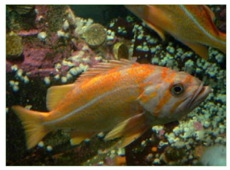
Canary rockfish.

catch and a comprehensive evaluation of species compositions for recorded landing categories, by region. This effort will likely affect all assessments for stocks that were targeted in historical California fisheries, and may also affect discard assumptions for non-target species. The newly reconstructed historical landings of canary rockfish in California are 24 percent lower than estimates developed as part of the 2007 assessment. In part, this change resulted from an improved ability to identify the area of fishing effort/landings within California, since most of the early effort was in the southern part of the state where canary is less common. The lower historic removals resulted in lower estimates of historic and current spawning biomass, as well as depletion (23.7 percent of virgin), leading to a longer rebuilding period than previously estimated. A canary rebuilding analysis will be reviewed in late September/ early October and considered for adoption in November. Results of the rebuilding analysis will be used to consider likely revisions to the rebuilding plan. The Council also may consider revisions to 2010 management measures to reduce canary rockfish impacts (see the article on inseason adjustments to