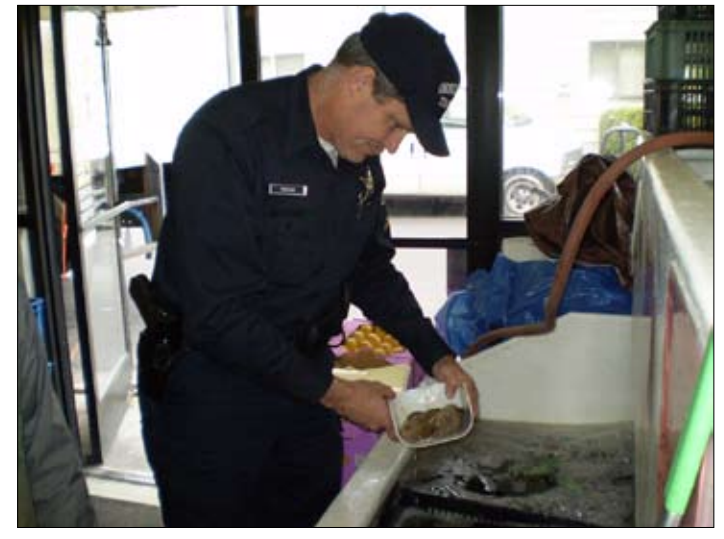
Oregon Troopers conduct a market inspection (above) and seize illegal gillnets (below)..

Mr. Steele's actions created a possible denial of market access to legitimate halibut fisherman and seafood dealers. In addition, his actions misled consumers into spending more of their family food budgets on what they believed to be a higher valued product. Mr. Steele was sentenced to 30 days imprisonment, fined $60,000, ordered to pay $100,000 as a community service payment, and placed on five years of supervised release.