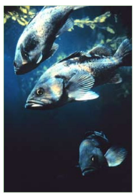
Black rockfish

The Council's final decision on whether and how to reduce petrale sole impacts in the 2009 -2010 biennium will be decided at the September Council meeting, along with final adoption of the petrale stock assessment. In September, the Council may reconsider Period 6 petrale trip limits as well as 2010 trip limits and a reduced optimum yield (OY) for 2010. Furthermore, the Council also discussed the possibility