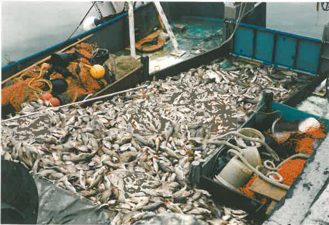
F10 Nore Dick A load of Widows! Neah, 1989.