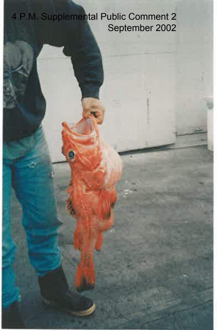
Same Idiot, Oct. 1998