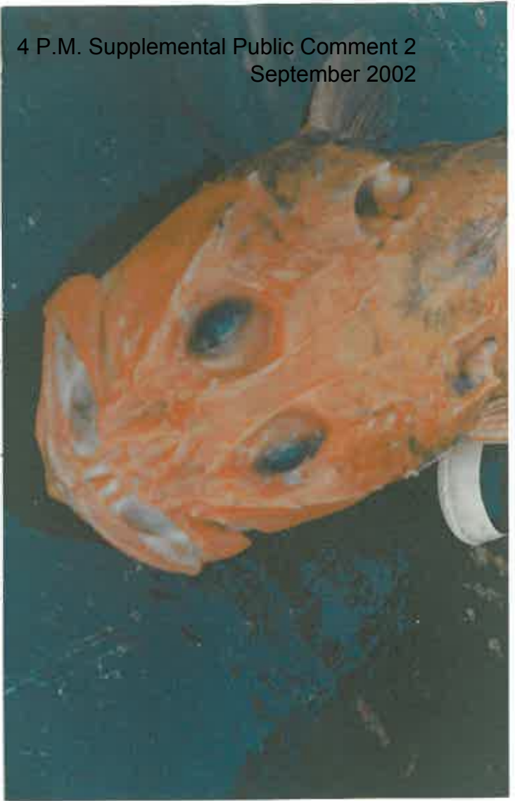
Head shot of an Idiot W' fish 1998