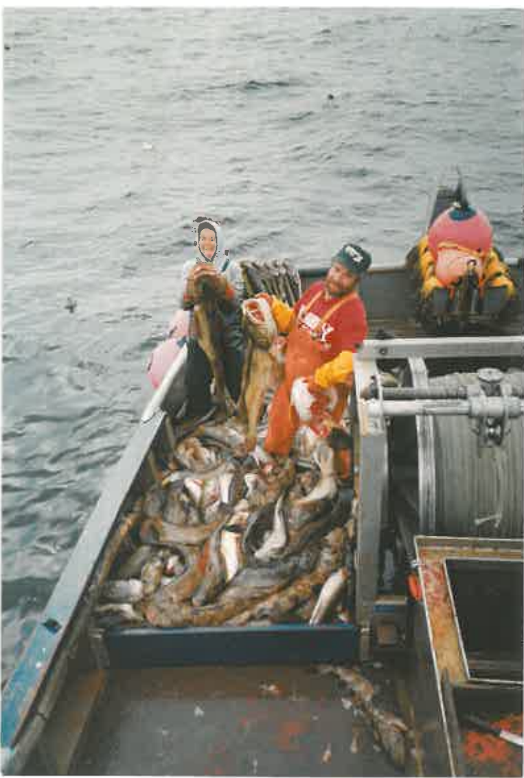
The Biggest I don't I've ever seen Oct 1988 report