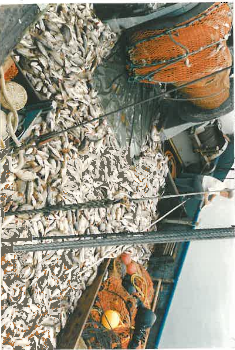
Flu Nordick Name Unknown! Naah, 1991