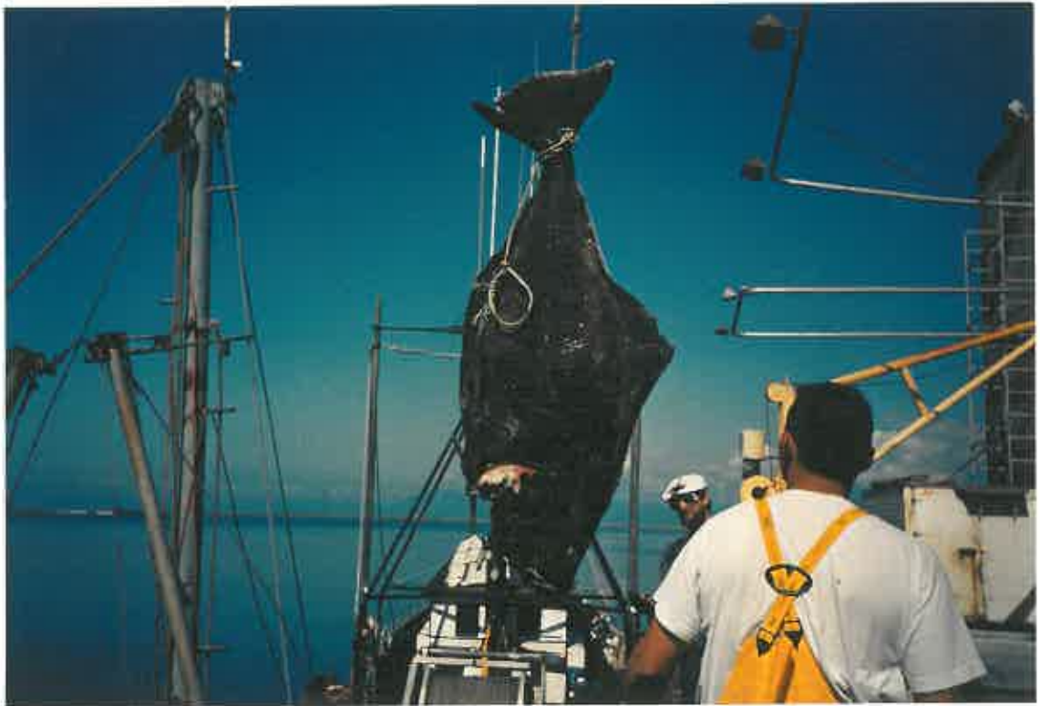
Big Butt off the "2", Naah,