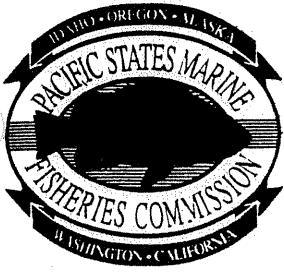
Exhibit C.2.b PSMFC Letter September 2001