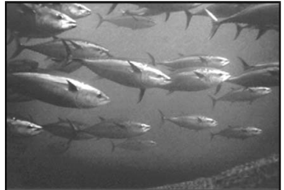
Bluefin tuna