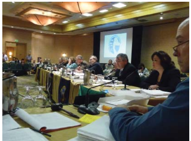
The November 2009 Council meeting.

The entire fishery management process is overseen by Congress, which controls funding for the councils; National Marine Fisheries Service; and the U.S. Coast Guard. States are also involved through their membership on the councils, their legislatures, and sometimes through research and enforcement. Interstate fishery