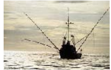
Salmon troller (NOAA)