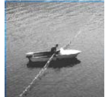
Tribal gillnetter